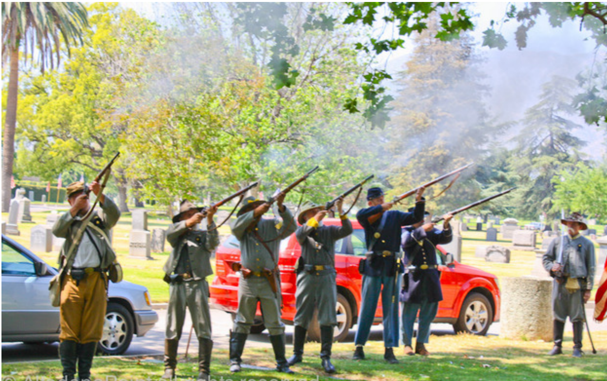
Riflemen in Civil War uniforms fire a 21-gun salute to remember the Civil War dead at Mountain View Cemetery on May 26, 2014.

27 May 10:01 , Published by Timothy Rutt, Categories: News Community